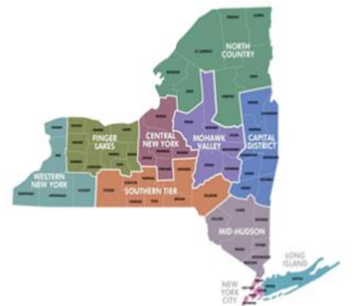
NEW YORK STATE REGIONAL MAP